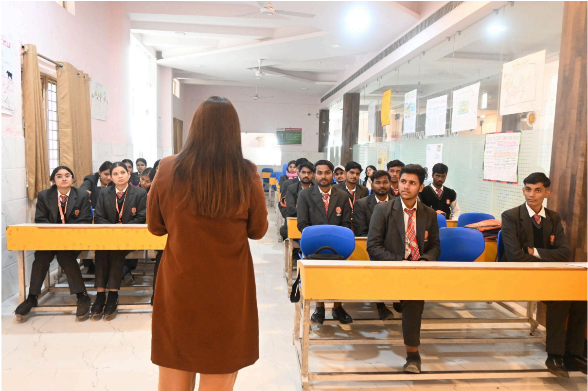
Faculty and students engaged in the session